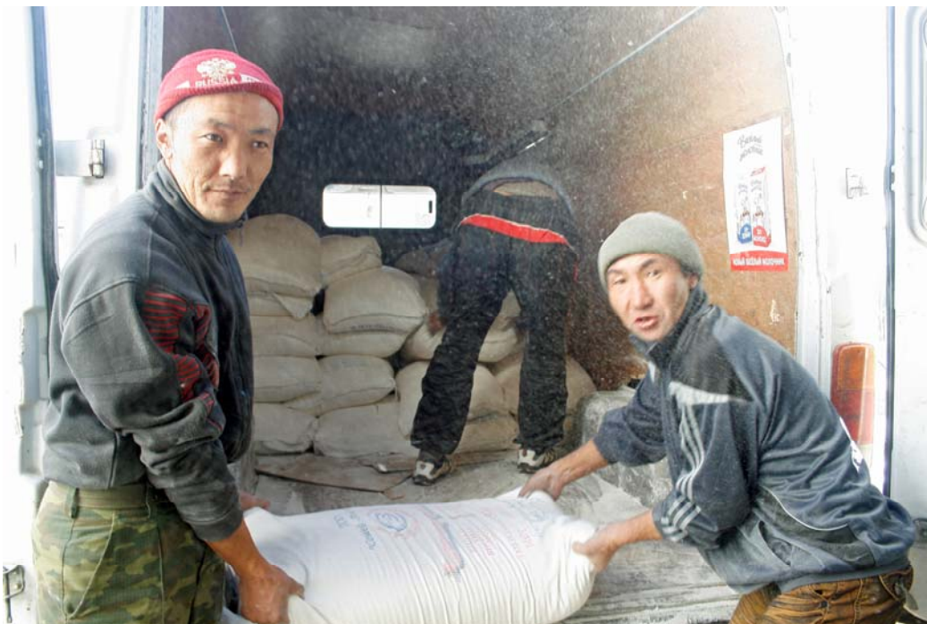
Flour Delivery in Kopuro Bazar