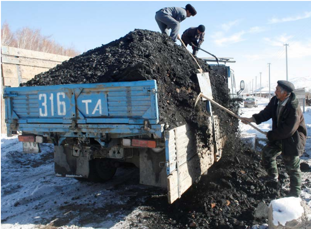
Coal delivery in Kopuro Bazar