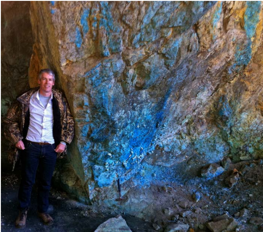
Copper ore at Aktash

The agreement gives Kentor the exclusive right to acquire the Aktash project after completing a drilling program of 1,500m. The Company has been completing the planning of an intensive exploration program involving a total of four diamond drill rigs. The program is scheduled to commence about April with the arrival of the northern spring.