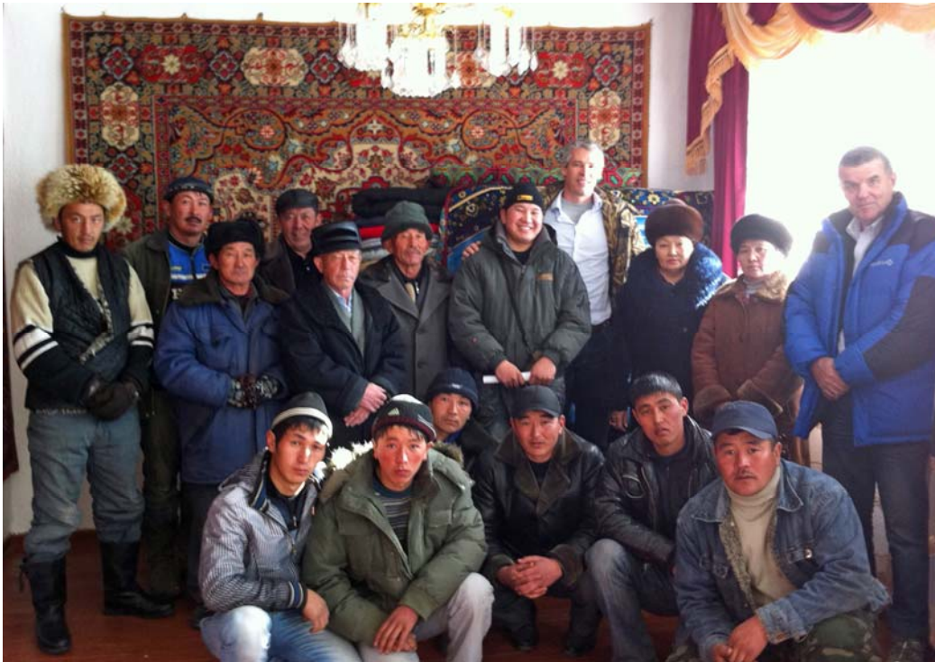
Andash Mining Company staff and supporters – Kopuro Bazar