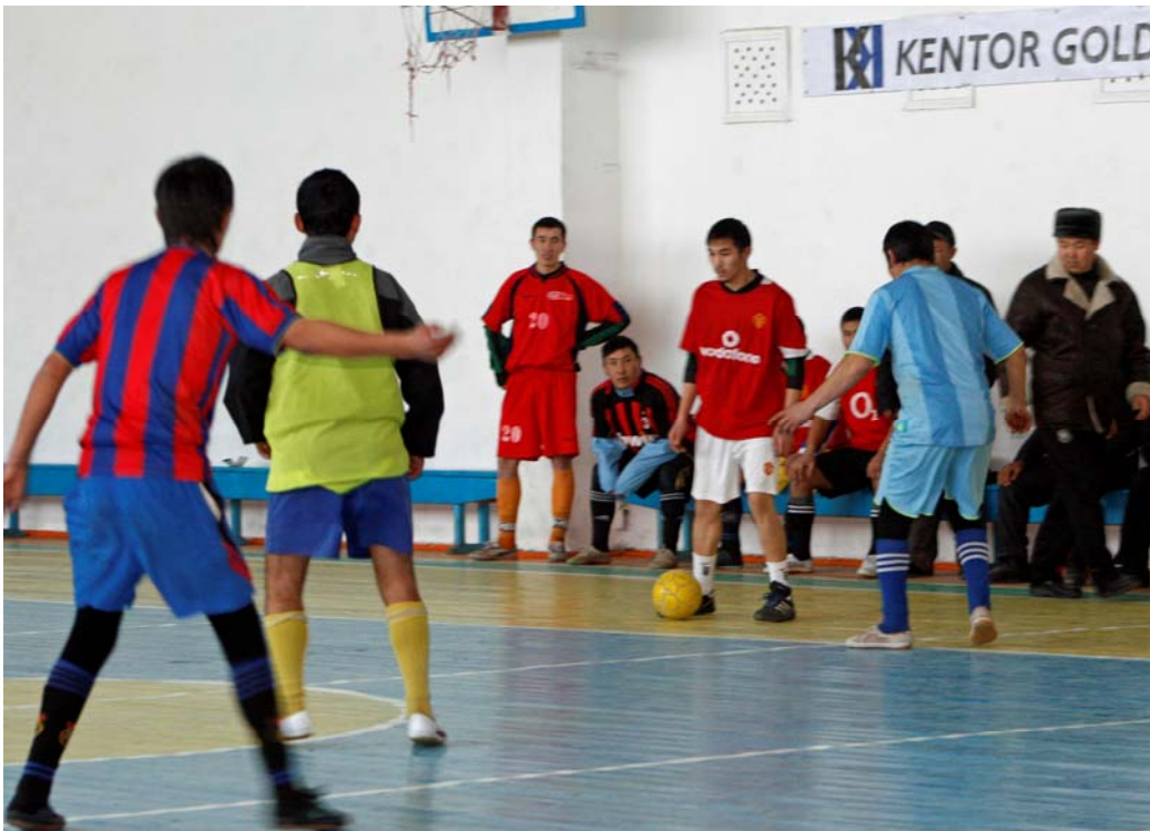
Kentor Gold sponsored sports tournament in Talas