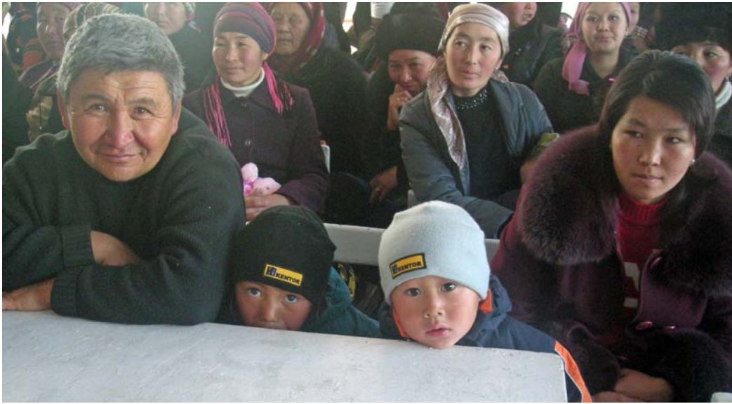
Community meeting in Kopuro Bazar