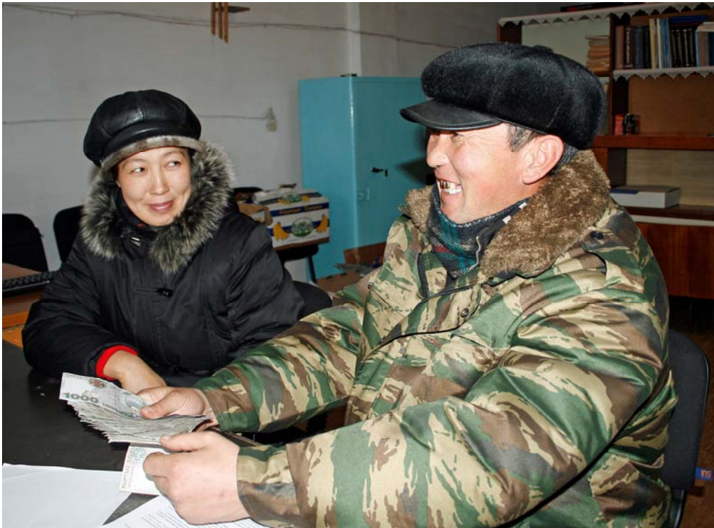
Micro-Finance loans to assist with sustainable development in the community